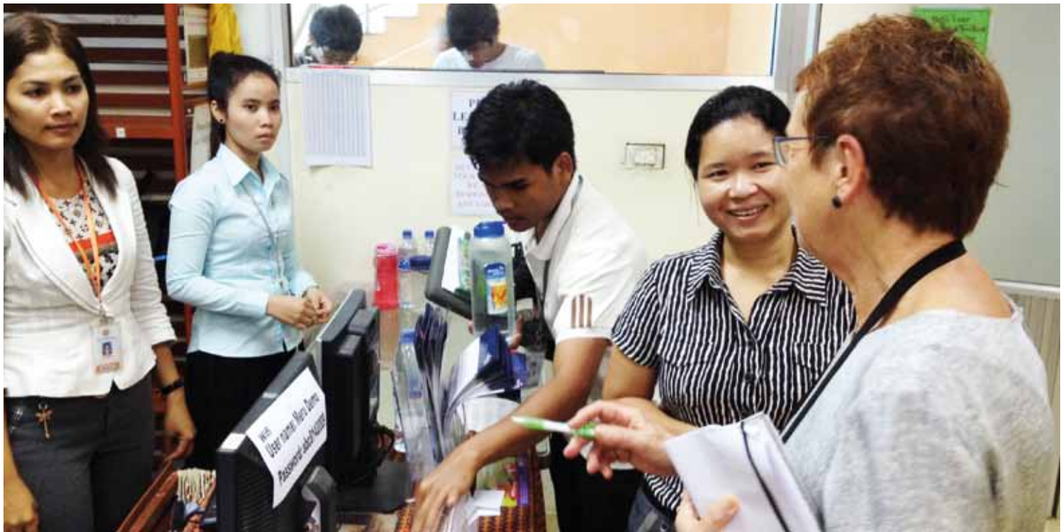
Librarians from the Raoul Wallenberg Institute visit the PUC library

Note: Application forms for both admission and scholarship are available at PUC Legal Clinic.