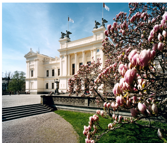
Lund University main building

The Institute cooperates with a variety of Swedish and international partners. In addition to the close cooperation with Lund University, the Institute maintains relations with other academic institutions, international organisations, government agencies and civil society organisations in different parts of the world. The Institute is member of several Nordic, European and international networks within the framework of its mandate.