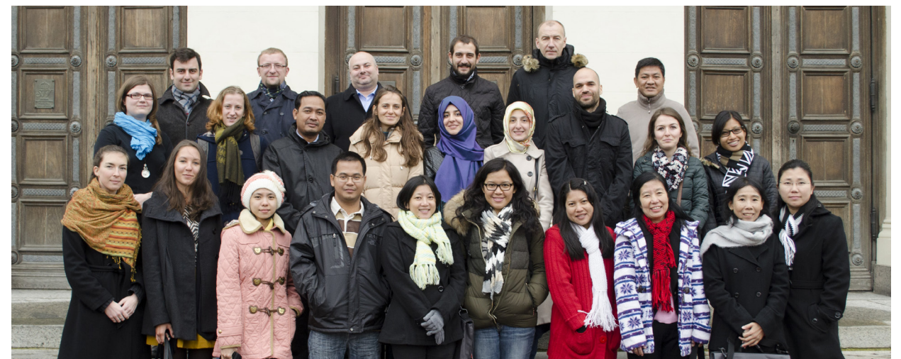
Participants in the Intensive Programme in Human Rights 2014

Important: All additional personal expenses will have to be paid for by the participants themselves.