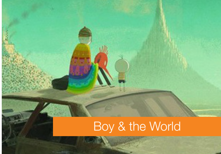
Boy & the World

A little boy's cozy rural life is shattered when his father leaves for the city, prompting him to embark on a quest to reunite his family. The young boy's journey unfolds like a tapestry, the animation taking on greater complexity as his small world expands.