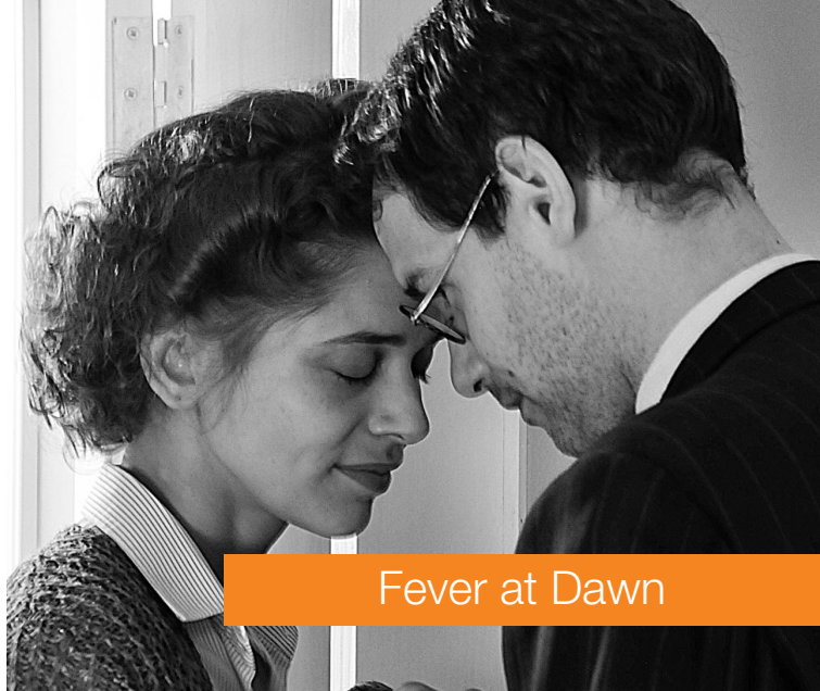
Fever at Dawn