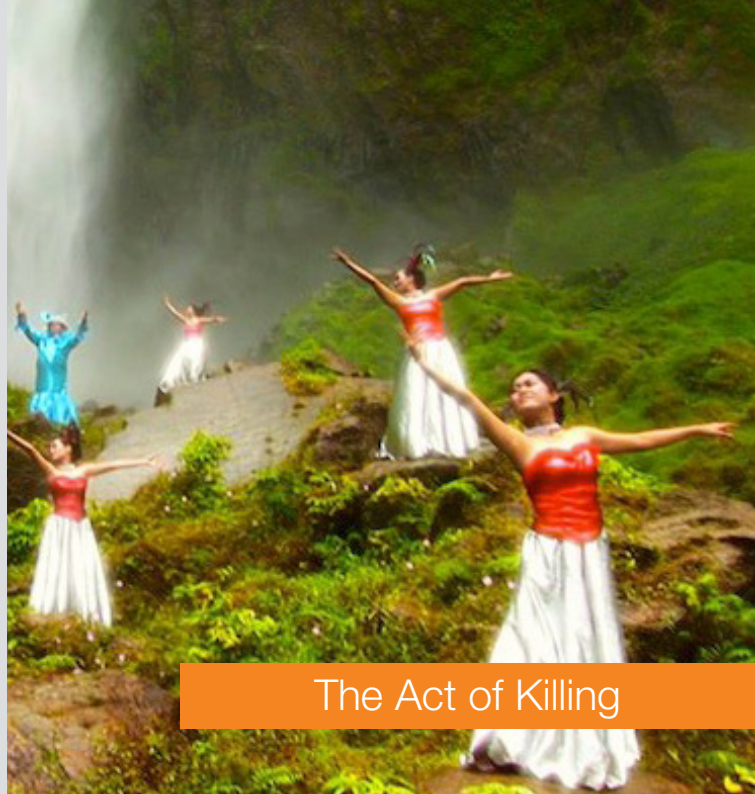
The Act of Killing