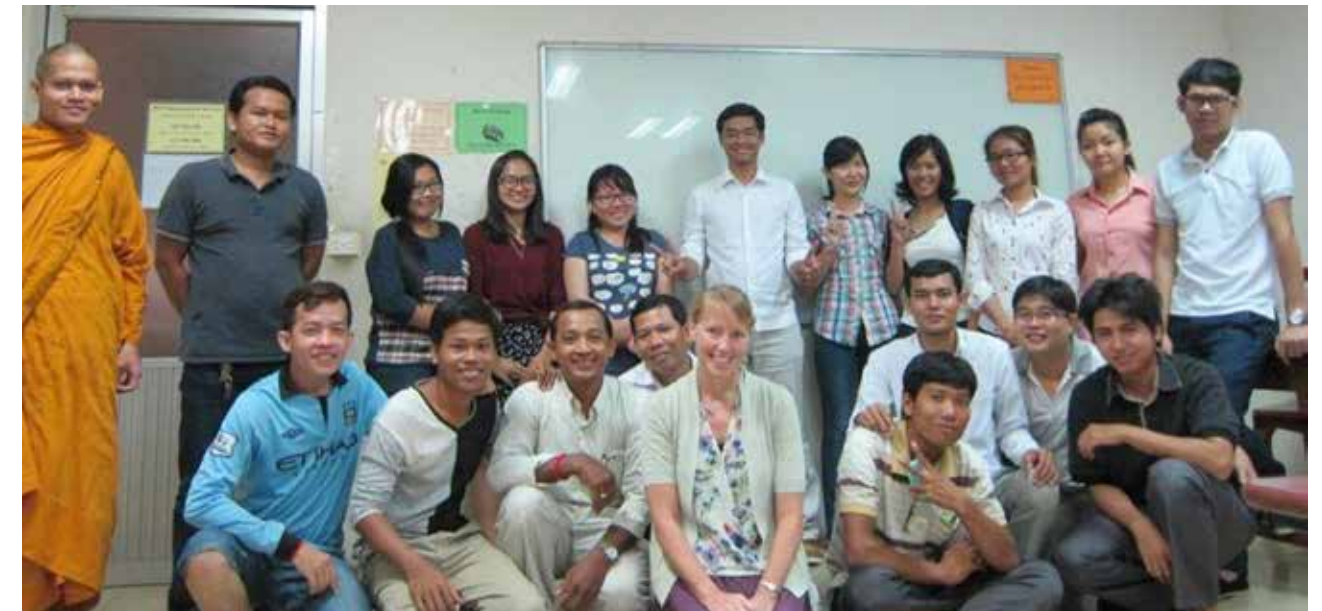
First batch of students at the Master Programme in International Human Rights Law at PUC. The students will graduate in September/October 2016.