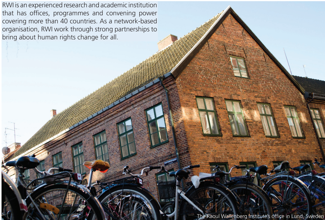
The Raoul Wallenberg Institute's office in Lund, Sweden

RWI is an experienced research and academic institution that has offices, programmes and convening power covering more than 40 countries. As a network-based organisation, RWI work through strong partnerships to bring about human rights change for all.