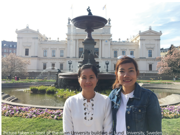
Picture taken in front of the main University building at Lund University, Sweden