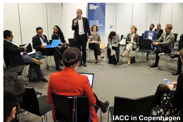
IACC in Copenhagen

“Conference participants came to discuss not only the problems caused by corruption but also ways to be make anti-corruption more effective. There was genuine interest in human rights approaches to anti-corruption, which opens opportunities for future collaboration, which is exactly what we advocate for in our report,” says Ryan.