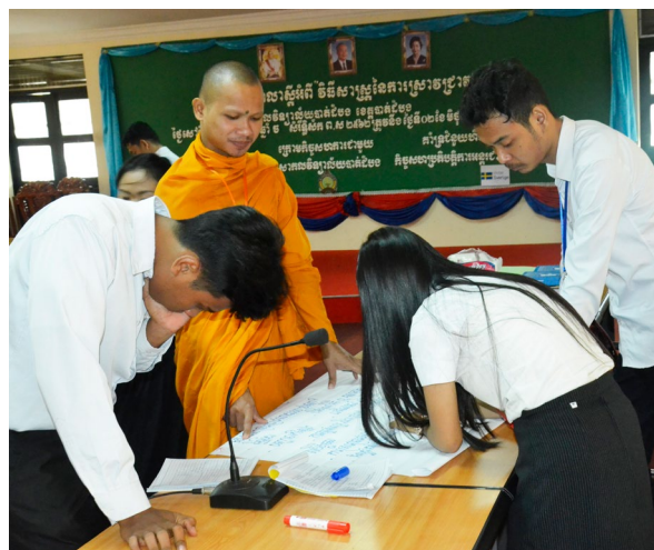
Students in Cambodia

Ultimately, the university's goal is that students will use their knowledge to give something back to society.