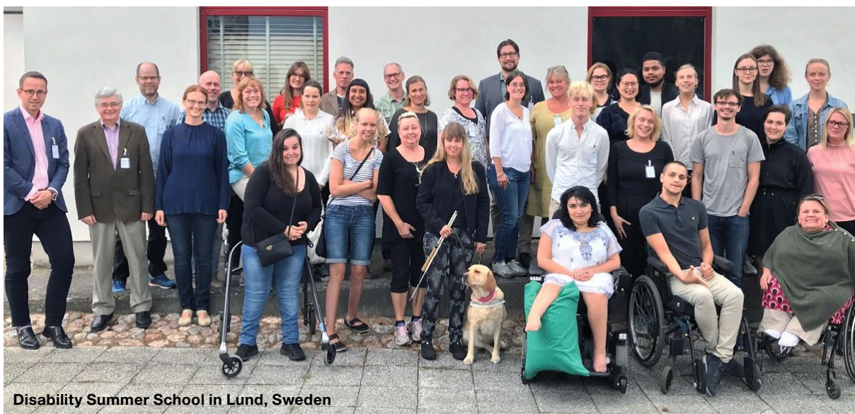
Disability Summer School in Lund, Sweden

In August 2018, RWI organised a four-day Summer School for disability rights and human rights in Lund in cooperation with Funktionsrätt Sverige (Disability Rights Sweden).