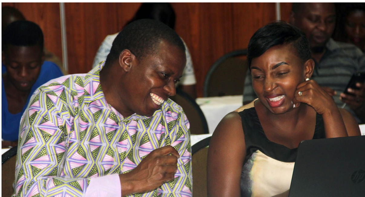
Gender work in Zimbabwe