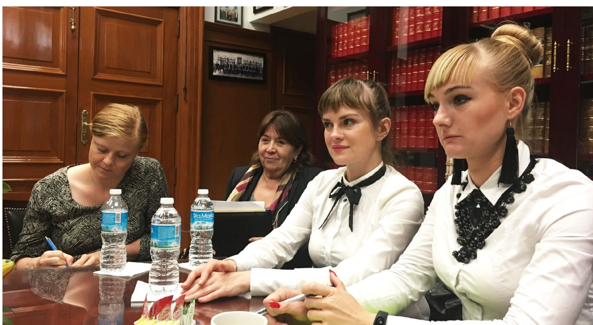
Conference in Mexico City