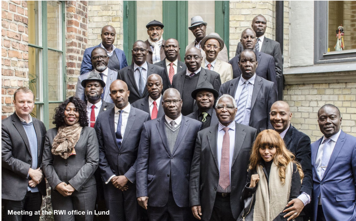
Meeting at the RWI office in Lund

RWI organised a study visit for judges and key staff from two important regional courts in East and West Africa in March 2018. The purpose was to launch a new phase in the cooperation between the Institute and the East African Court of Justice (EACJ) and the Community Court of Justice of the Economic Community of West African States (ECOWAS CCJ).