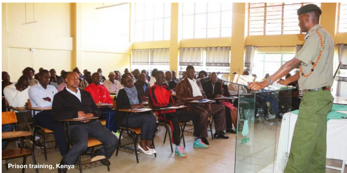
Prison training, Kenya

The RWI office in Nairobi was invited in September 2018 by the Commandant (Director) of the Prison Staff Training College (PSTC) in Kenya to, for the first time, train prison staff instructors on the UN Standard Minimum Rules for the Treatment of Prisoners.