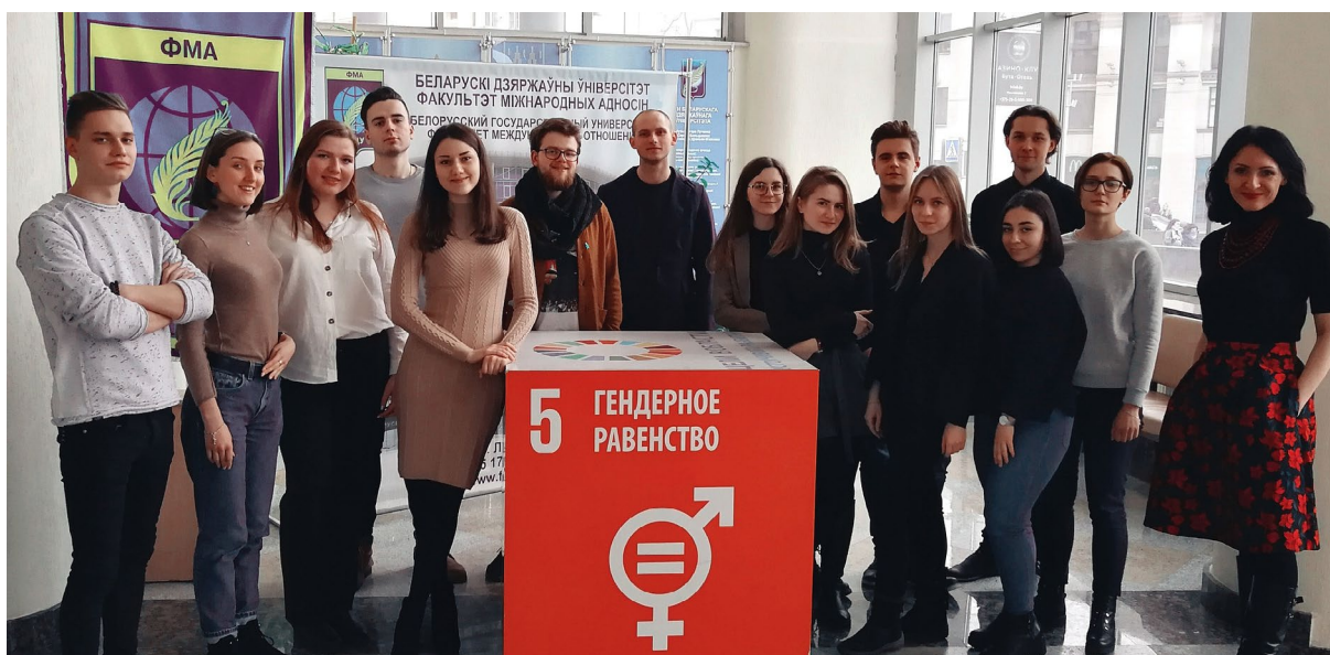
Gender and Law courses with Belarusian students

Student representatives have also contributed to the promotion of the new courses with a creative campaign informing their peers about the gender courses and their importance throughout Belarus.