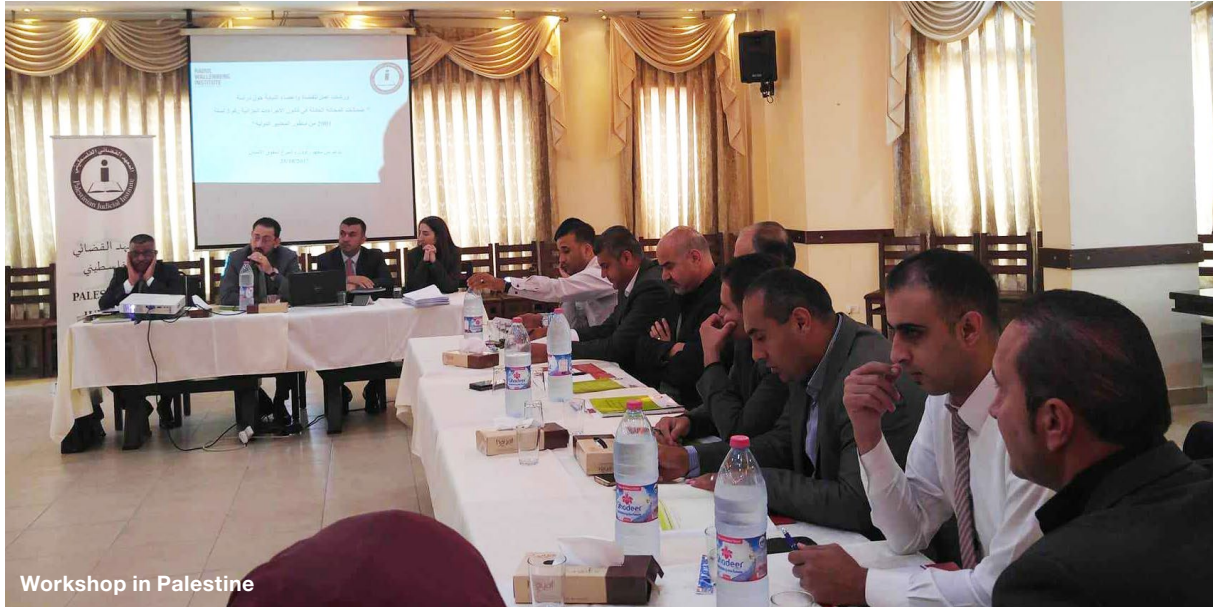
Workshop in Palestine

A joint expert meeting workshop was conducted in Ramallah in May of 2018 in close collaboration with the Faculty of Law and Public Administration at Birzeit University. The workshop aimed at revisiting the draft training manual produced during the first quarter of 2018 on “the Application of International Standards for Fair Trial Guarantees”.